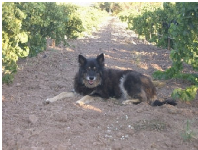
VINEYARD SUPERVISOR "JAG"

... only a tiny amount made, but an amazing wine from 128 year old vines... available in early 2005.