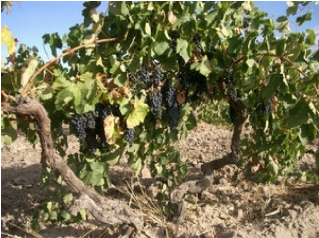
JOHANN GEORG SHIRAZ

Johann Georg Shiraz... not a great volume, but certainly a great wine, very stylish.