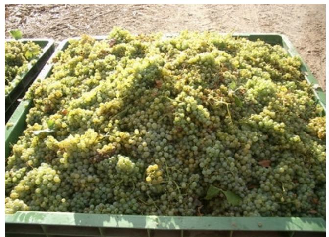
FRESHLY PICKED SEMILLON FOR CLARRY'S WHITE

The winemaking... Following the cool night harvesting of the Chenin Blanc and morning hand-picking of the Semillon, the grapes were crushed, pressed and the juice immediately cooled to retain the fresh fruit vibrancy. The juice was cold settled for 48 hours followed by a cool fermentation with light grape solids incorporated for added complexity. The wine was bottled shortly after fermentation to fully capture the freshness of the grapes and has been sealed with a screw cap to retain maximum vibrancy.