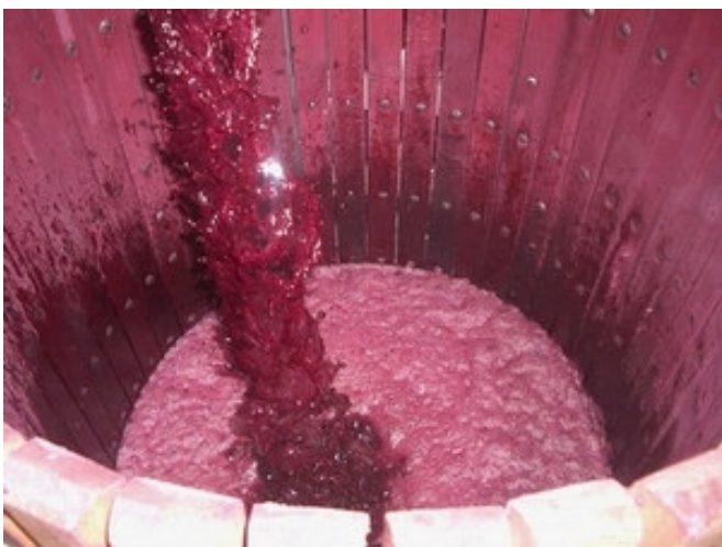
DRAINING GREENOCK SHIRAZ INTO BASKET PRESS

So overall, a very pleasing vintage from 2004!