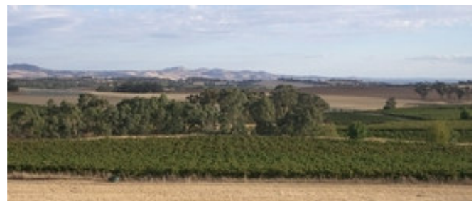
OVERLOOKING THE KALLESKE VINEYARD

Across the board 2004 has produced some excellent wines. The reds are all currently maturing in oak hogsheads and are looking good, with deep colour and an abundance of fruit flavours.