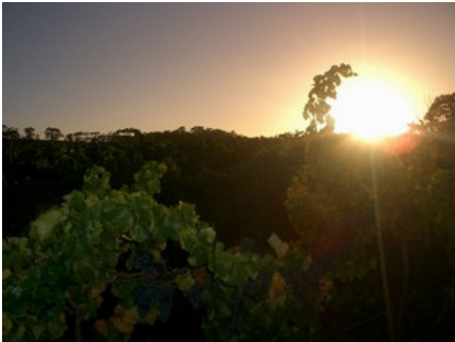
VINTAGE SUNRISE OVER CLARRY'S GRENACHE VINEYARD