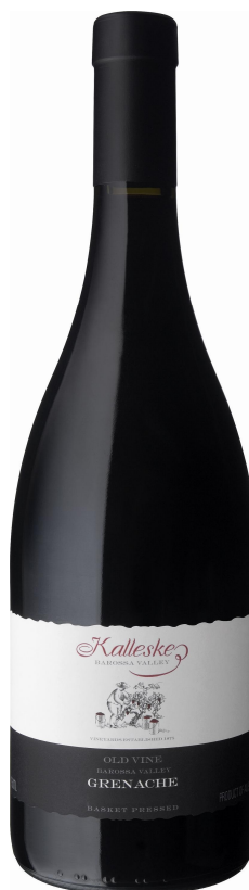
Top 100 Wines 2008, The Advertiser, Nov 2008

A huge complex wine combining subtle cherry fruit, cola, licorice and spices on the nose, with elements of leather and tobacco showing up to play. A classic, full-on Grenache that offers a big mouthful of tannins, warm, rich spices and sour cherry flavours, that will come to an even more exciting crescendo after several years.